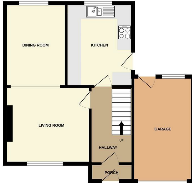
GROUND FLOOR 571 sq.ft. (53.0 sq.m.) approx.